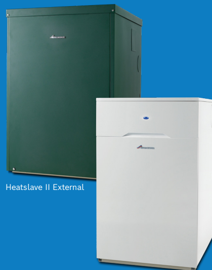
Heatslave II External

High performance even in harsh weather conditions^